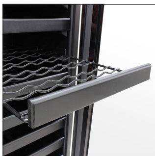
Empty Wine Shelves