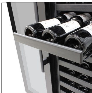
Bottles on Wine Shelves