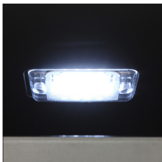
Top Interior Light