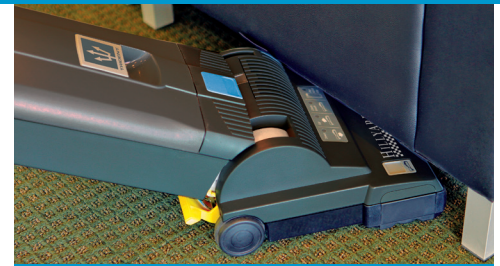
Flat-to-Floor for Easy Cleaning