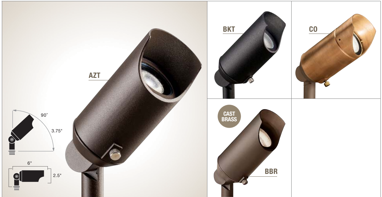
15384 AZT, AZT 20L, AZT 24, BBR, BKT, BKT 24, CO - MINI ACCENT