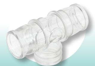
Nebulizer Tee Connectors

STANDARD 22 MM OD × 18 MM ID × 22 MM OD CONNECTIONS