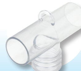
Aerosol Tee Connectors

STANDARD 22 MM OD × 15 MM ID × 22 MM OD CONNECTIONS