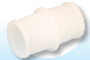
Corrugated Cuff Adaptors