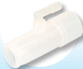
Pressure Line Adaptors

22 MM OD × 22 MM ID CONNECTIONS BARBED ELBOW ACCEPTS 5-7 MM ID TUBING · ELBOW SWIVELS 360°