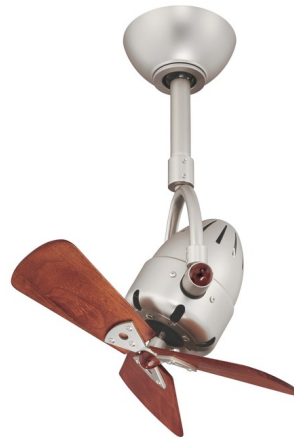
Shown in brushed nickel / mahogany wood