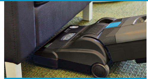
Flat-to-Floor for Easy Cleaning