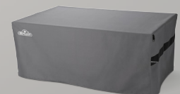
OPTIONAL UV PROTECTED FITTED COVER