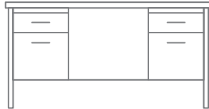
29.5" H x 60" W x 24" D