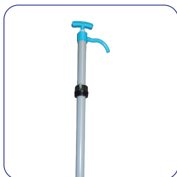
Tolco 160114 Pump

Another option is a top-mounted mechanical pump that uses a suction tube to pull/pump out the solution. These pumps attach to the center portion of the 6" cap found on the top of the IBC tote. For transferring Accelerated Hydrogen Peroxide AHP® products, only a corrosion resistant (non-metal) pump should be used. Basic tools may be required for installation.