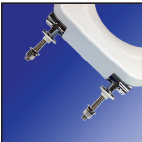
304 stainless steel non-corrosive hardware