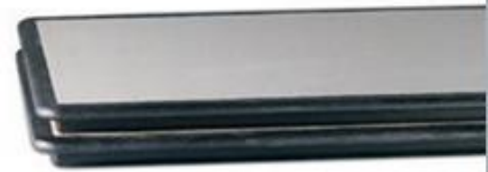
Legs fold into recessed cavities allowing tables to stack flat, providing maximum storage capability.