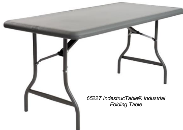
65227 IndestrucTable® Industrial Folding Table