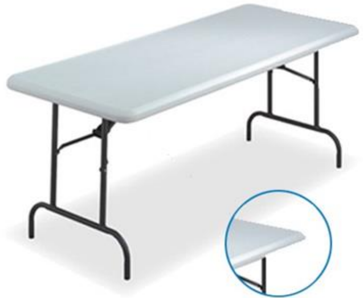
Round Beveled Edge