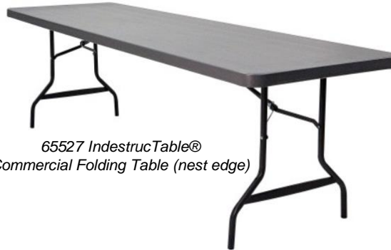
65527 IndestrucTable® Commercial Folding Table (nest edge)

Easy to transport, set up and take down, lightweight, multi-functional and handles any temporary demand. The square edge is dent and scratch resistant yet easy to clean. Made in USA.