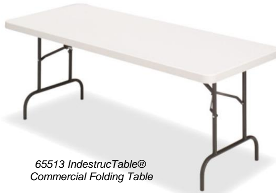
65513 IndestrucTable® Commercial Folding Table