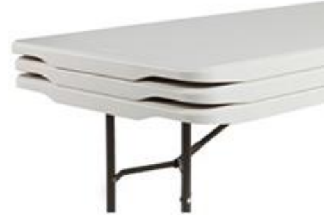
65523 IndestrucTable® Commercial Folding Table (nest edge)