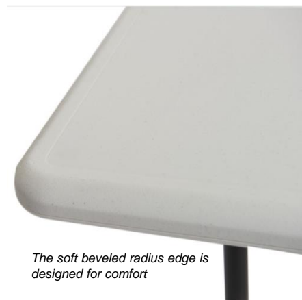
The soft beveled radius edge is designed for comfort