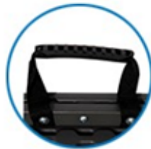
Comfort handle for easy transportation