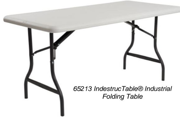
65213 IndestrucTable® Industrial Folding Table

Lightweight, multi-functional industrial grade table handles any temporary demand. The soft beveled radius edge is designed for comfort. Dent and scratch resistant yet easy to clean. Made in USA.