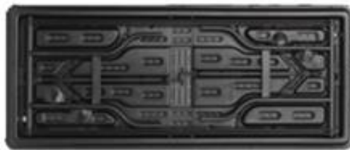
Lightweight and portable, the built-in hand grips provide easy room-to-room movement for temporary work surface or banquet use.