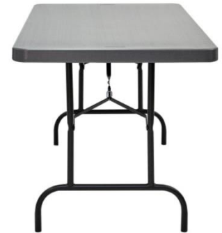
65537 IndestrucTable® Commercial Folding Table