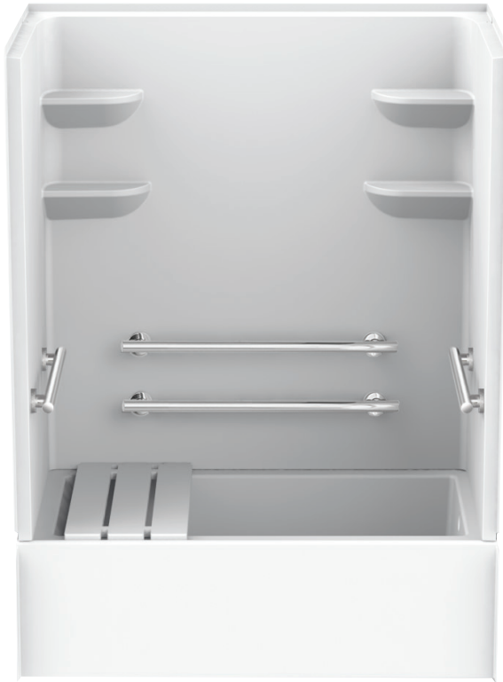
*Optional seat shown