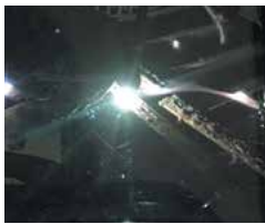
HD lens WALTER HD lens

See color in its truest form with WALTER's exclusive HD technology. This innovative feature increases the range of visible light when looking through the welding lens. This means you'll see more natural colors, providing a clearer, more defined view of your work area.