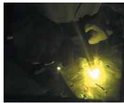
Non HD Competitor lens

FOR MORE INFORMATION, TO SCHEDULE A FREE DEMO OR TO ORDER: