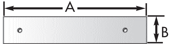
2 HOLE STUD GUARD