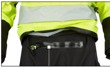
YKK AQUASEAL relief zipper

The Quick-Lock™ waist closure system converts the top and bib into a single suit with strong dry suit performance. Suits sizes have color coded webbing tab for easy reference. Top & bottom must be size matched for the Quick-Lock™ waist closure system to work as intended.