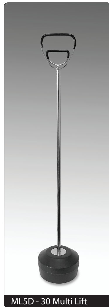
ML5D - 30 Multi Lift

The Magnet Source® brand is a trademark of Master Magnetics, Inc. and represents exceptional quality, expertise and customer service.