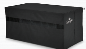
OPTIONAL UV PROTECTED FITTED COVER