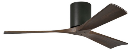
Shown in matte black / walnut tone

The Atlas Irene Hugger Ceiling Fan is rustic yet strikingly modern, with cleanly joined solid wood blades and a minimal cylindrical motor housing. Its streamlined profile with the warm, natural look of wood works beautifully in contemporary and transitional spaces. Equipped with a DC motor, the fan is energy efficient and ultra-quiet. A hand-held remote control and wall control are included, both able to turn the motor on/off and set 6 speeds and forward/reverse. For fans that have a light, the controls also turn the light on/off and dims it. Fans that have a light include a cap matching the housing finish for no-light use. Note: Some combinations of motor finish, blade color, and light option are not available. The 72 inch is available in a 3-blade only and is not available with a light option.