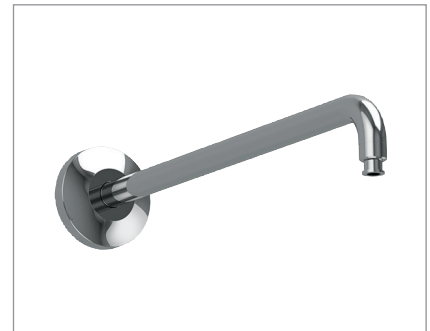
TBW07025U: Rain Shower Arm Wall-Mount, 16"

Please note the following components are sold separately