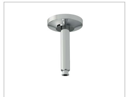
TS110MC6: Rain Shower Arm Ceiling Mount 6"