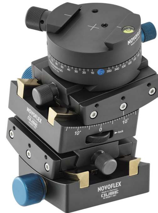
Illustration shows product variant QUBE-PRO

Congratulations on your purchase of the new goniometer head QUBE. Whilst you should have no difficulty in using your modular geared head, you may find the following explanations useful.