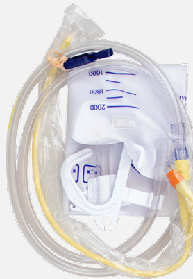
FOLEY CATHETER, DRAINAGE BAG & BED SHEET CLAMP