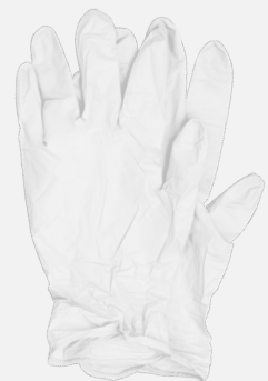
2 VINYL GLOVES