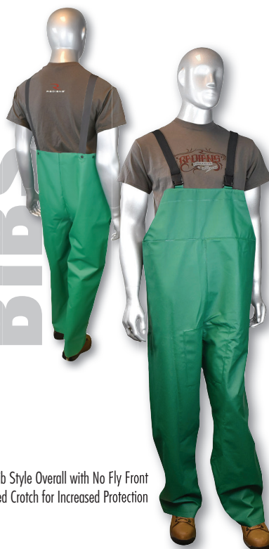
Bib Style Overall with No Fly Front Reinforced Crotch for Increased Protection