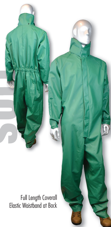
Full Length Coverall Elastic Waistband at Back