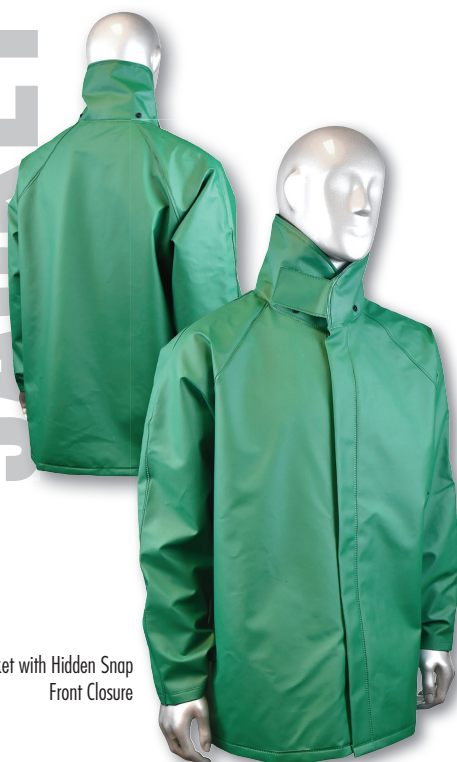
Jacket with Hidden Snap Front Closure