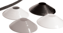
COLORED CONES (8)