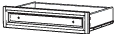
T. Drawer 1 pc.

Refer to 20 05427 0692 instructions for drawer assembly.