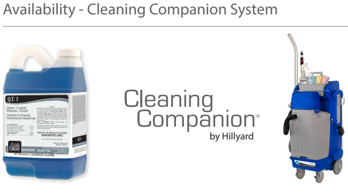
Refill Item No: HIL0071722 Case Pack: 6 - 2L Containers