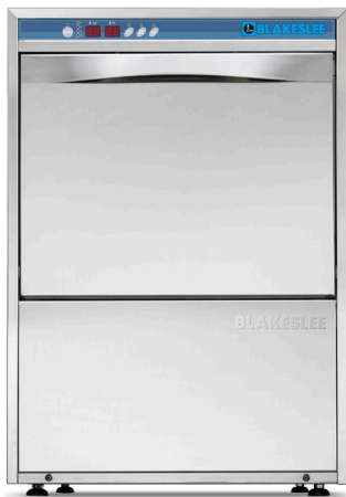
UC-18D-1 / UC-18D-3