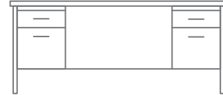
29.5" H x 72" W x 36" D