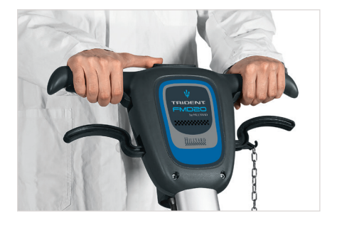
Safety system requires machine activation by simultaneous pressure of the handlebar levers and button. When the levers are released the FMD20 stops.

It is a single disc machine, robust and easy to maintain. With a stainless steel frame and PPL coating, it combines efficiency and versatility together with modern ergonomics. The FMD20 is equipped with a new nylon gear box for long life, high reliability and quiet operation. The removable power cable makes transport and maintenance easier.