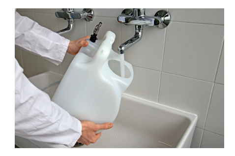
Easy-to-remove solution tank simplifies refills and clean-up.