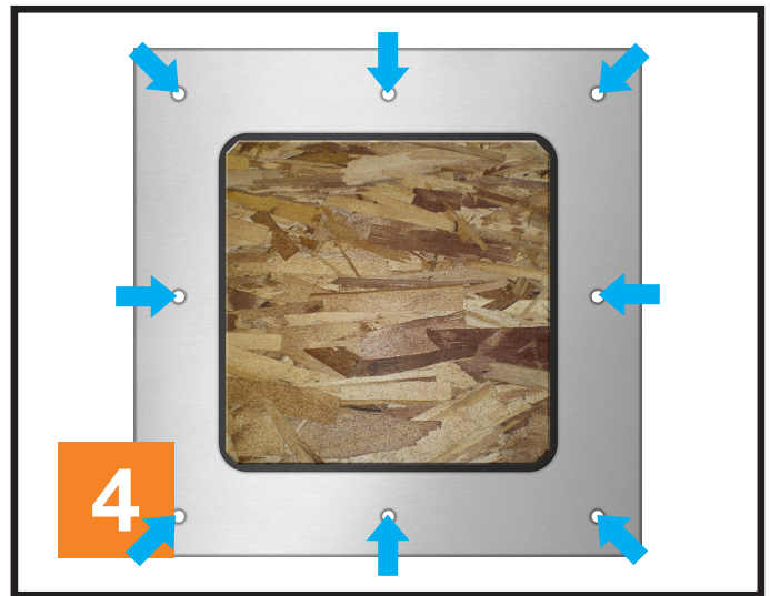
Nails must be installed in all 8 pre-punched locations.