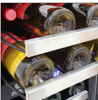
Racking with Stainless Lip