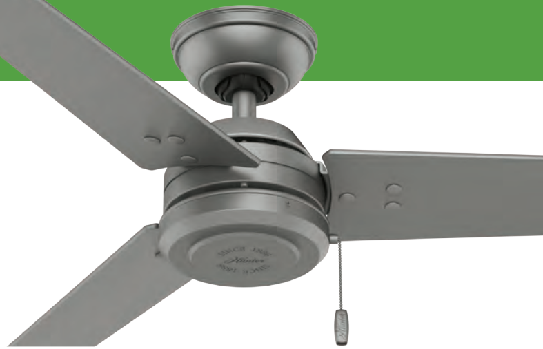
59262 - Matte Silver Finish

3 MOUNTING OPTIONS: Low • Standard • Angled Ceiling PULL CHAIN OPERATION LIMITED LIFETIME WARRANTY