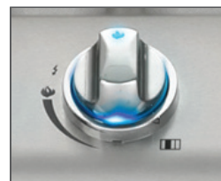
i-GLOW™ Backlit Control Knobs