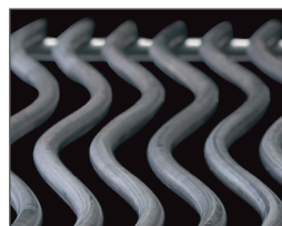
Stainless Steel WAVE™ Cooking Grids