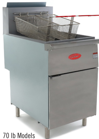
70 lb Models

General fryers are so versatile they can handle an array of fried foods, holding, 40, 50 and 70 lbs of oil in a stainless steel tank and the tank is embossed to reflect the correct oil level. The stainless steel front access door is field reversible with a dual wall removable exhaust flue make General Fryers versatile and can adapt to any kitchen designs. Cooks, chef's and kitchen staff can easily control the General commercial fryer with thermostatic millivolt controls, which are adjustable from 200 to 400 degrees Fahrenheit.