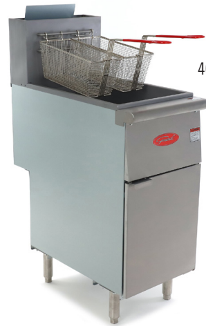
40 lb / 50 lb Models

MODEL: GFF3-40(LP/N) GFF4-50(LP/N) GFF5-70(LP/N)