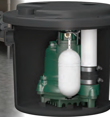
Preassembled Model 105