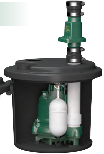
Unassembled Model 105

These are our most versatile water collection systems. No need to dig a sump pit or re-route plumbing drain lines. This compact system includes everything you need to remove water from areas without gravity drains. Excellent for bar sinks, laundry trays or condensate removal. There are no inlet filters to clean, and easy compression fittings make for quick and trouble-free installations. As an added bonus, the P-trap can be located inside the tank if necessary.