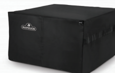
OPTIONAL UV PROTECTED FITTED COVER