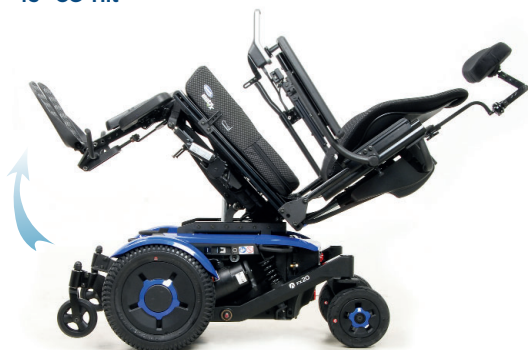
45° CG Tilt