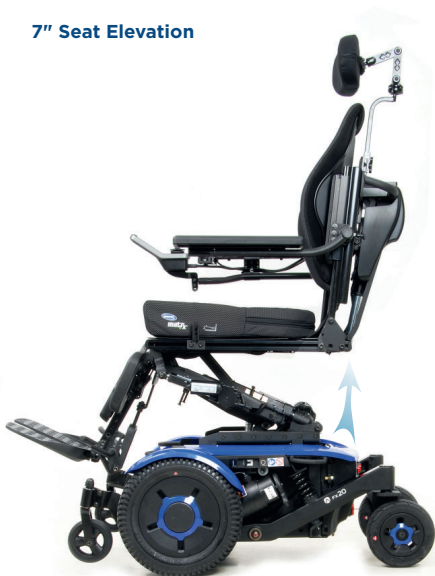
7" Seat Elevation