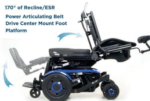
170° of Recline/ESR Power Articulating Belt Drive Center Mount Foot Platform