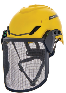
V-Gard H1 Safety Helmet with Mesh Face Shield