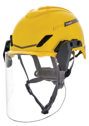
V-Gard H1 Safety Helmet with Clear Face Shield