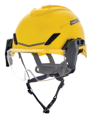
V-Gard H1 Safety Helmet with Half-Face Spectacles