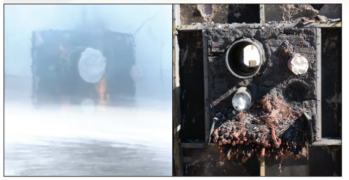
See how the barrier stands tough against hose stream and survives fire. Watch the fire test video at www.3M.com/Firestop