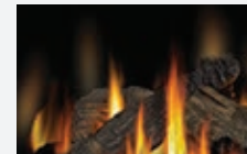
MIRRO-FLAME™ Porcelain Reflective Radiant Panels