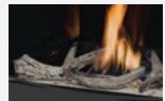
Mineral Rock Kit