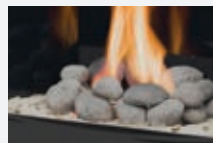
Shore Fire Kit