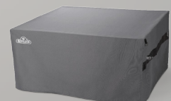
OPTIONAL UV PROTECTED FITTED COVER