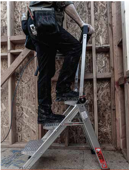
Stable Hand Rail