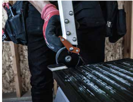
Quick-Release Rotating Hand Rail