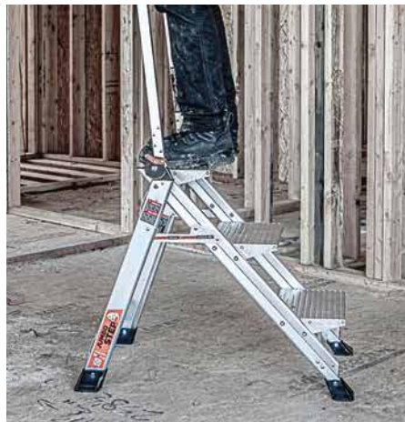
Wide Steps with Ridged Traction