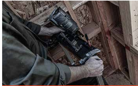
Large Tool Tray