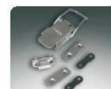
Stainless steel latch MOEDL:LC-02