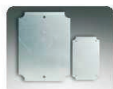
Steel mounting plate