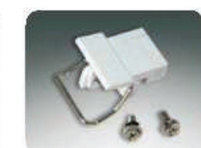
plastic latch for box MG MOEDL:PL-01