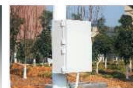
Fixed on the telegraph pole