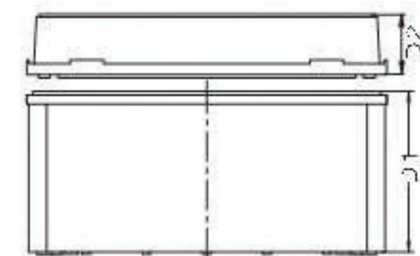
Cover + body