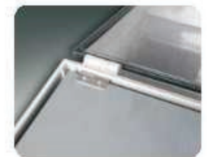
Fixed with inner plate