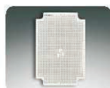
Plastic mounting plate