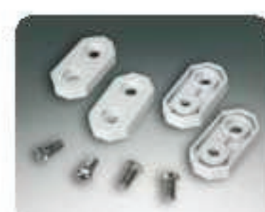
Wall brackets for big plastic box MOEDL:MG