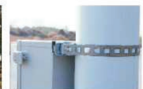
Fixed on the telegraph pole