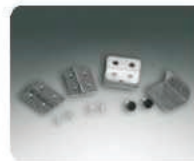
hinges for fixing inner door MOEDL:WG-02