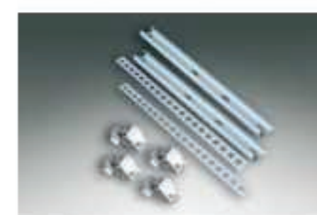
Hoop(telegraph pole fixing) MOEDL:BG 080