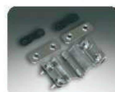
Stainless steel hinge MOEDL:HG-02