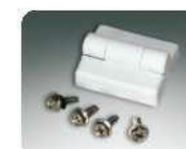
plastic hinges for box MG, KG MOEDL:PH-01