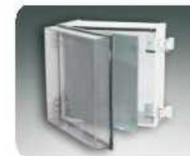
Fixed with inner plate