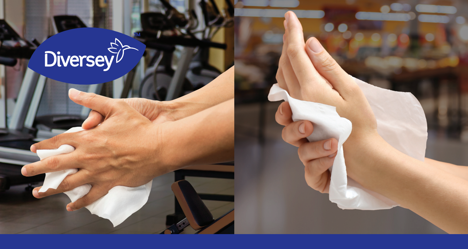
Give Customers A Safer Shopping Experience