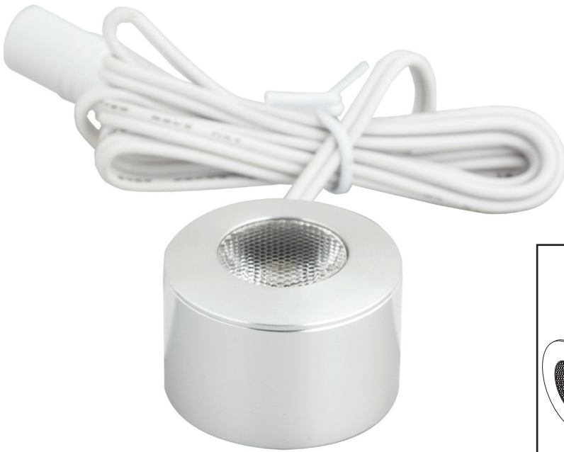
Brushed Aluminum fixture shown L-MR-CL-1BA-30