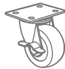
4" H x 3.25" D