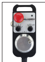
User-friendly portable handwheel