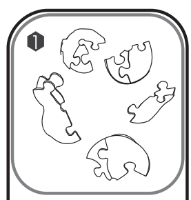
Don't lose any of the puzzle pieces.