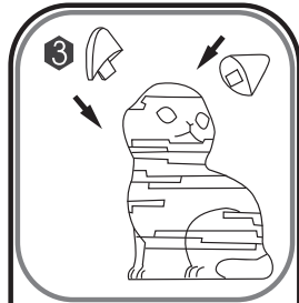
After assembling the Cat's body, insert the two ears into the head of the Cat.