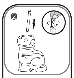
After assembling piece #37, insert the center pole #38, turn it tightly with the key enclosed. Then cover it with #39.