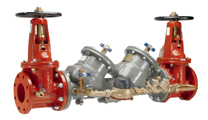
Model 856ST Double Check Detector Assembly

The FEBCO MasterSeries 856ST Double Check Detector Assemblies are designed to protect drinking water supplies from dangerous cross-connections in accordance with national plumbing codes and water authority requirements for non-health hazard non-potable service applications such as irrigation, fire line, or industrial processing. This Backflow Assembly is primarily used for protection of drinking water systems and fire sprinkler systems, where Local Governing Code mandates protection from non-potable quality water being pumped or siphoned back into the potable water system.