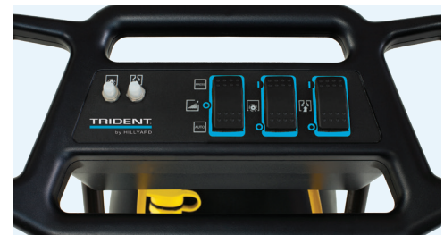
User-Friendly Intuitive Controls