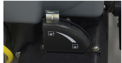
Three Position Adjustable Brush