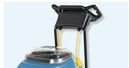
Push/Pull Operation For Productivity