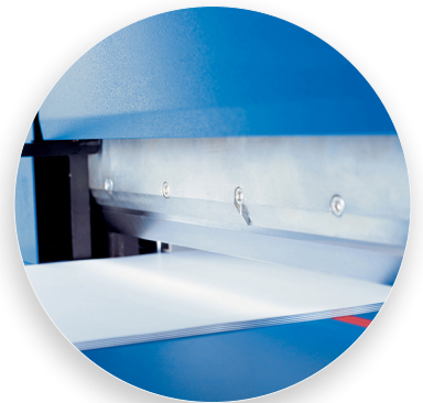
Effortlessly cut through stacks of paper with the machine ground steel blade.

The Dahle 846 Professional Stack Cutter cuts up to 500 sheets of paper with minimal effort. Designed for precision, it features a machine ground blade for smooth trimming, built-in safety features, and a spindle-driven backstop for accuracy. This German engineered cutter is designed for durability and is ideal for print & copy shops, corporate printing departments, and custom printers.